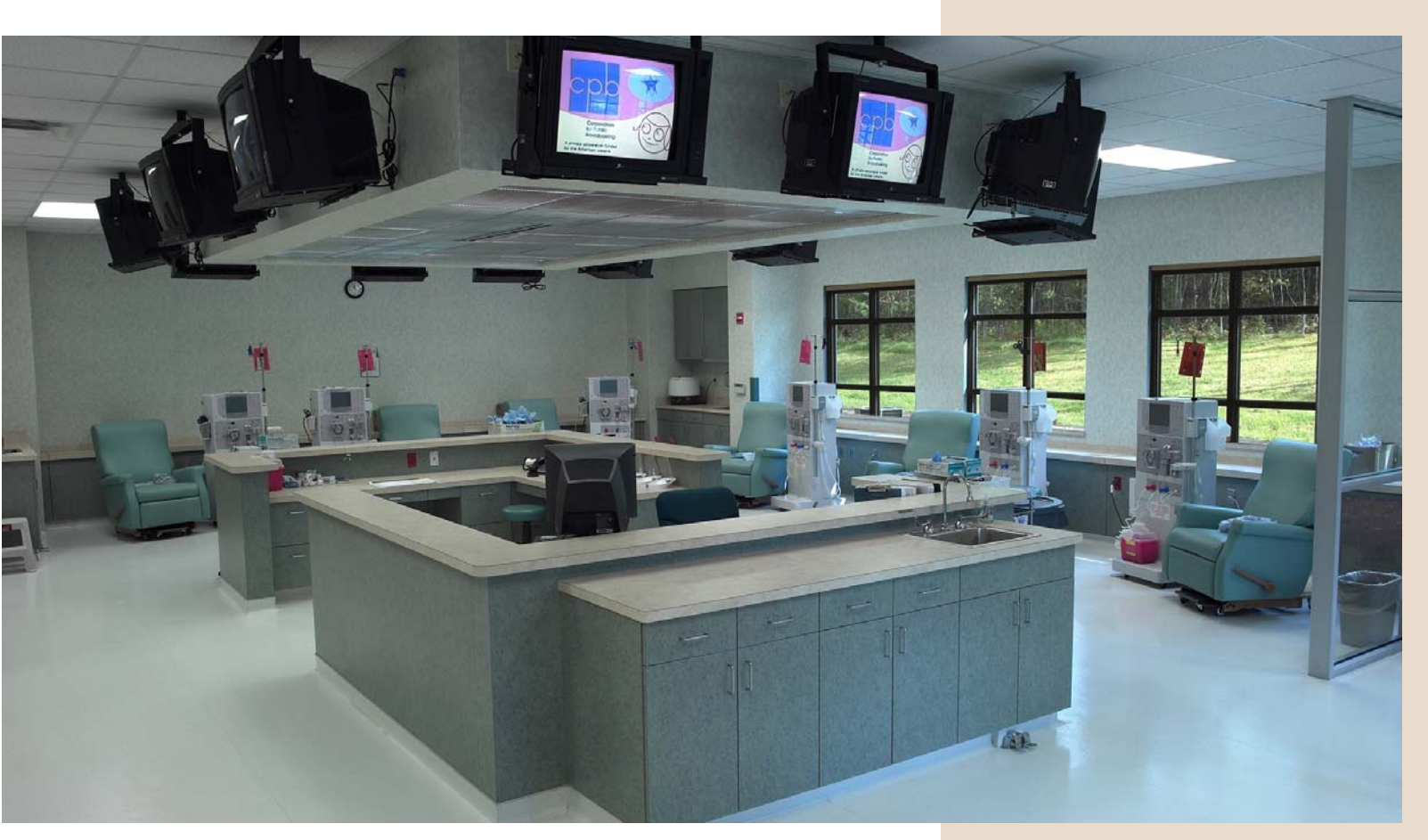
DCi, Dialysis Clinic