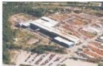
Augusta Civic Center