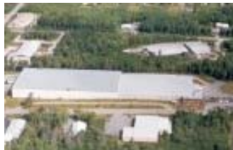
Van Baalen Pacific