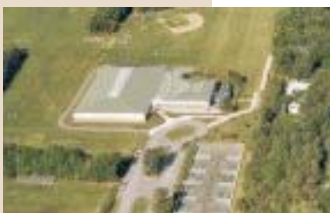
Bowdoin Field House

When you work with Sheridan you will have a team of "in house" engineering specialists with a wide variety of experience. A team that interacts with select subcontractors to provide you with cost efficient solutions to your individual operating requirements. Our experience includes paper mills, co-generation plants, exhibition halls, arenas, manufacturing plants, airplane hangars, athletic facilities, prisons, refrigeration buildings, retail and warehouse distribution facilities.