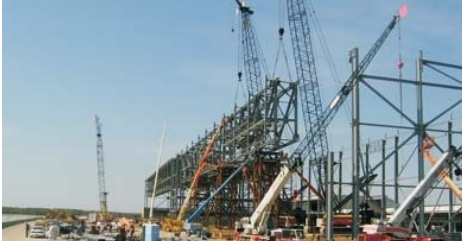
Hangar 6, Brunswick Naval Air Station

Since 1947 The Sheridan Corporation has been providing Maine industry with high quality heavy industrial construction. Sheridan, in association with Butler Manufacturing Company, can offer the benefits of local design, permitting and construction expertise with the strength and support of a nationally recognized metal building designer and fabricator. By combining the strength of mill steel for the primary structural members with the performance and value of pre-engineered secondary and cladding systems we can deliver the lowest in-place cost building system to meet your requirements.