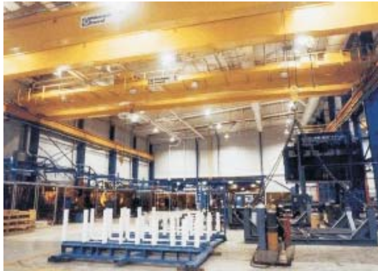
General Electric Diaphragm Fabrication Facility

Since 1947 The Sheridan Corporation has been providing Maine industry with high quality heavy industrial construction. Sheridan, in association with Butler Manufacturing Company, can offer the benefits of local design, permitting and construction expertise with the strength and support of a nationally recognized metal building designer and fabricator. By combining the strength of mill steel for the primary structural members with the performance and value of pre-engineered secondary and cladding systems we can deliver the lowest in-place cost building system to meet your requirements.