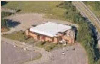
Augusta Civic Center

Our skilled team of engineering sales managers can assist you in selecting the best structural design elements to fit your individual needs. Using the latest in computer aided estimating systems we can provide you with fast, accurate cost estimates that will determine project costs up front which will save you time and dollars. If you already have estimates on a structural system we are able to offer a Sheridan-Butler value engineered alternative which in most cases will result in significant savings.